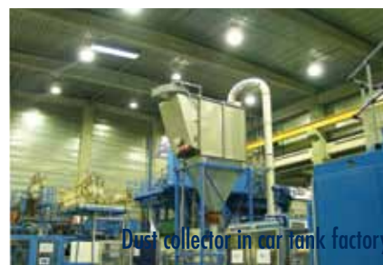
Dust collector in car tank factory