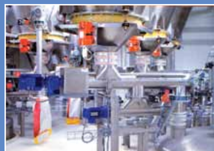
Bin activators and precision screw feeders