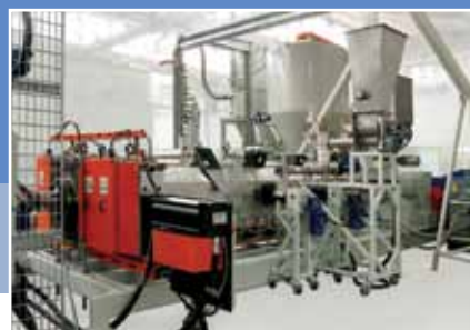
Micro-batch feeders on top of extruder