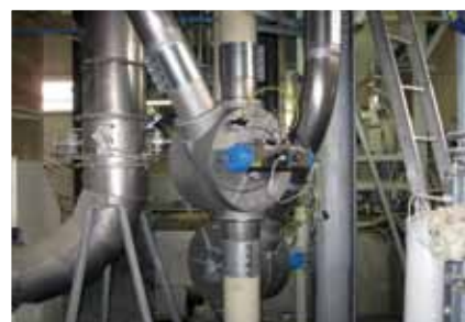
Drum-type diverter valve in pneumatic conveying system